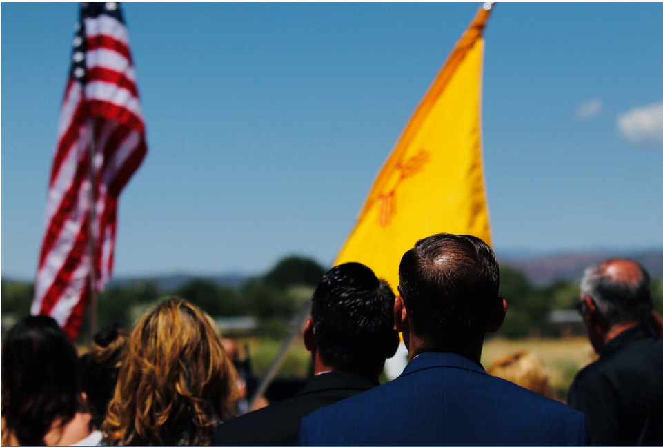
Lt. Governor Morales, Auditor Colón, and attendees look on as the color guard presents the United States and New Mexico State flags