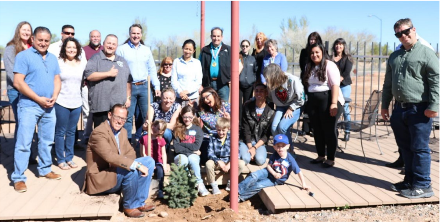
Team OSA with family of staff pose after planting a blue spruce.