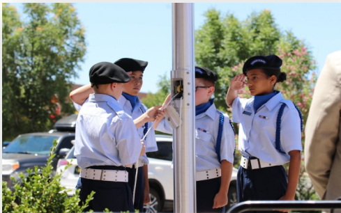
Wilson Middle School "Wildcat Squadron" salute while raising the US and NM State flags.