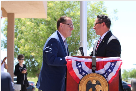
State Auditor Colón & Lt. Governor Morales share a handshake

The 25 foot flagpole installed at no cost to the taxpayers. Both the United States flag and New Mexico State flag flown at the Office of the State Auditor were originally flown over the United States Capitol Building and the New Mexico State Capitol Building, respectively. The ceremony included presentation of colors by State and National award winning Wilson Middle School's 470th "Wildcat Squadron" Leadership Cadets; the singing of the National Anthem by New Mexico recording artist, Robyn Christian; and remarks by Lt. Governor Howie Morales, PhD.